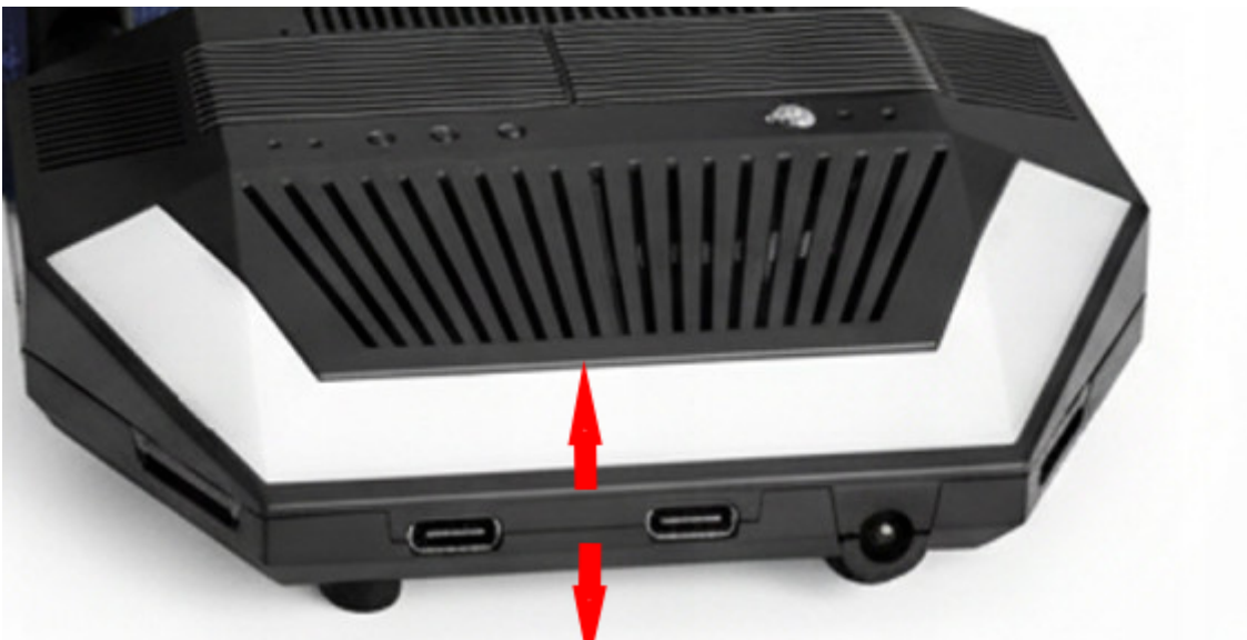
Carefully pull off the top and bottom covers