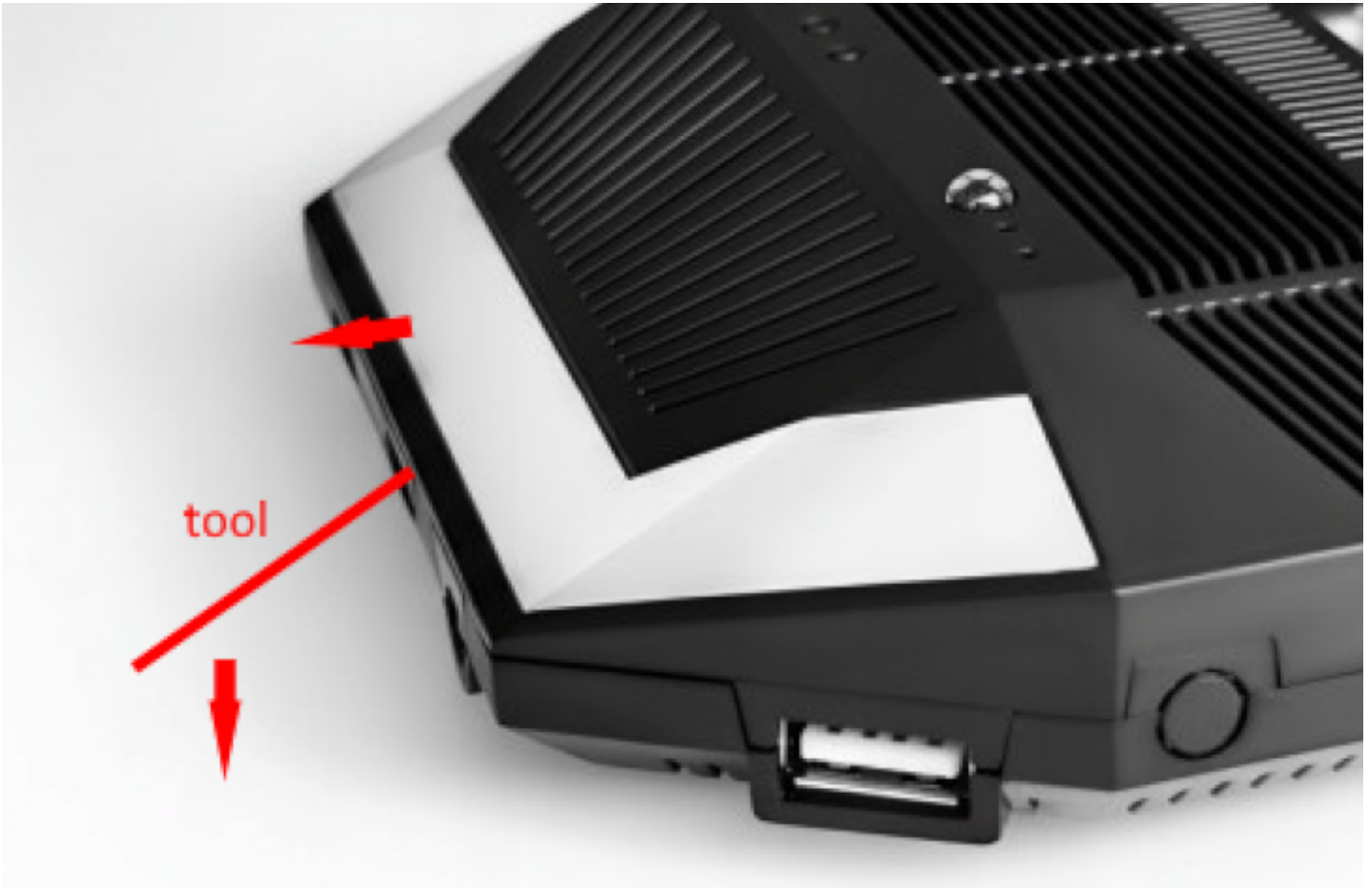
Carefully pull the top cover forward using the tool, leaning against the Type-C